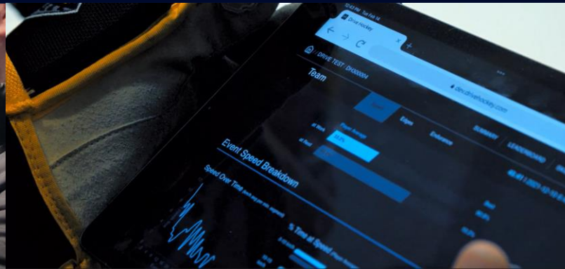
AI analyzed performance