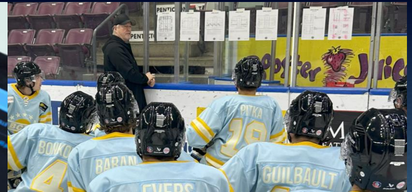
Adjust & improve

Patented IP built around proprietary AI, data and hardware – simple & affordable, built on a scalable cloud stack