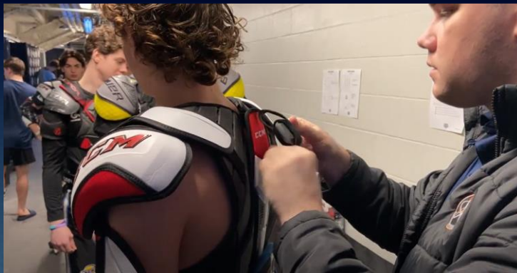
Players wear sensors